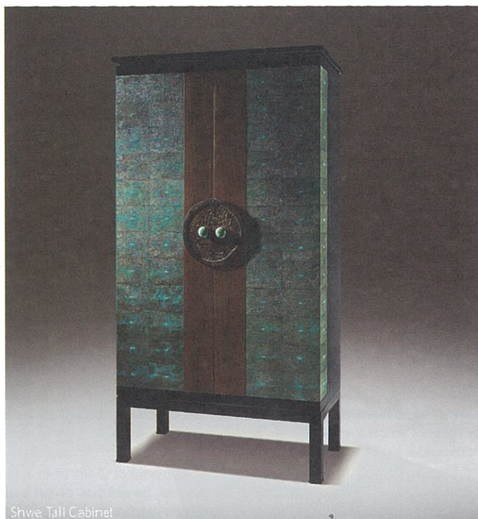
Shve Tall Cabinet