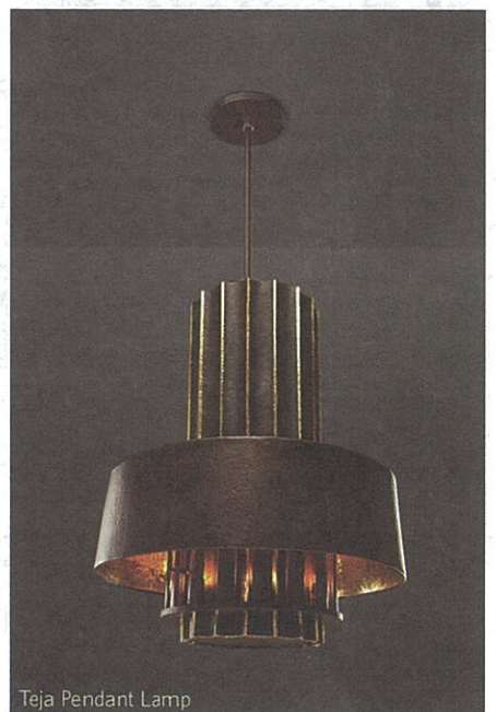
Teja Pendant Lamp