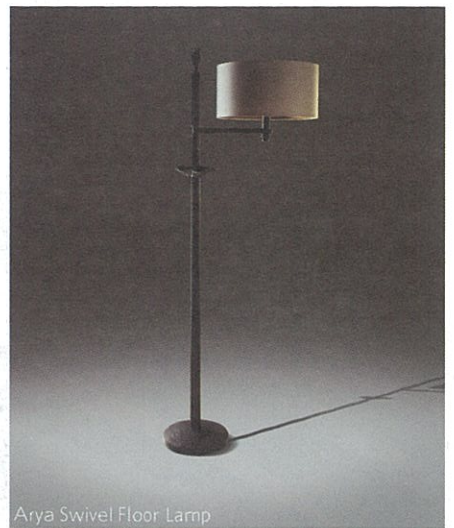
Arya Swivel Floor Lamp