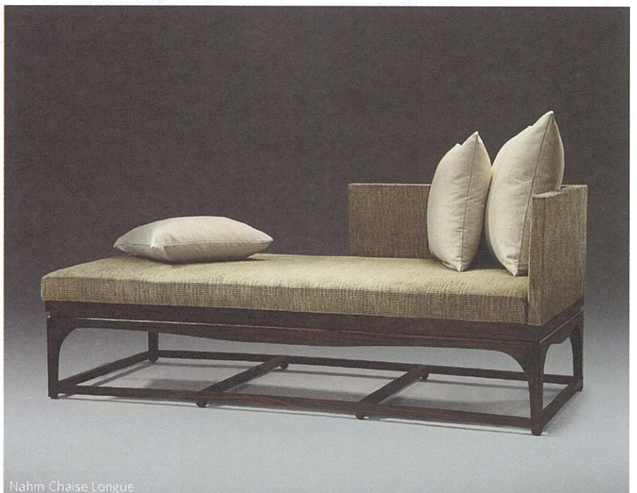
Nahm Chaise Longue