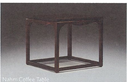
Nahm Coffee Table