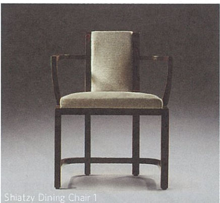
Shiatzy Dining Chair 1